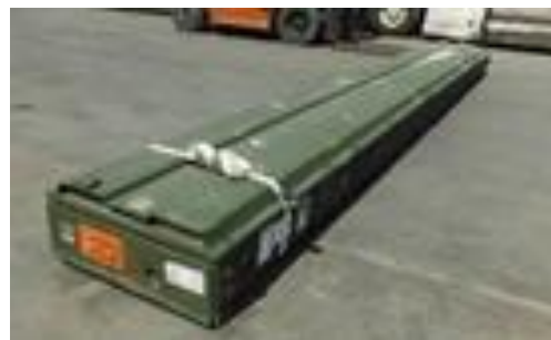
3X Rotary Blade