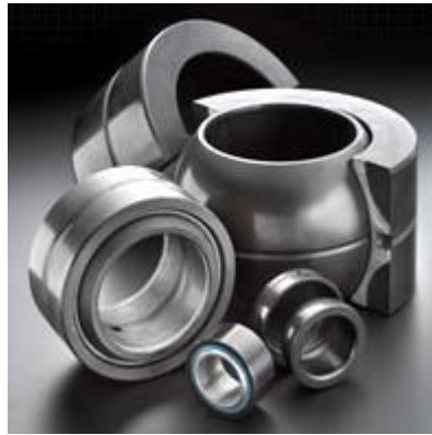
Sphere Plain Bearing