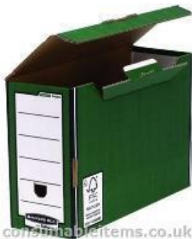
Case Filing Transfer Straight